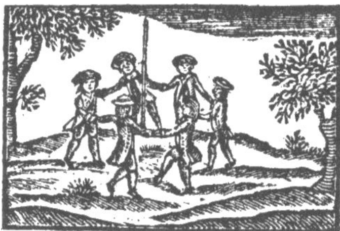
May Pole, Isaiah Thomas, 1767