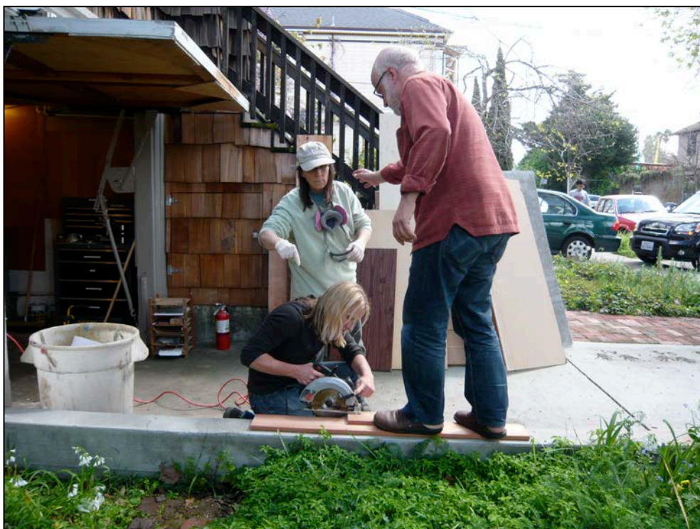
Work Day

Thanks to everyone for your diligence and effort!