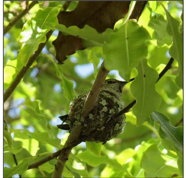
A hummingbird has made BZC gardens her home this spring.