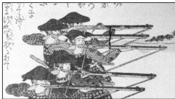
Drawing by Utagawa Kuniyoshi, 1855.

Without forgetting all this, I am wishing you a New Year full of wisdom, compassion, composure, and deep joy.