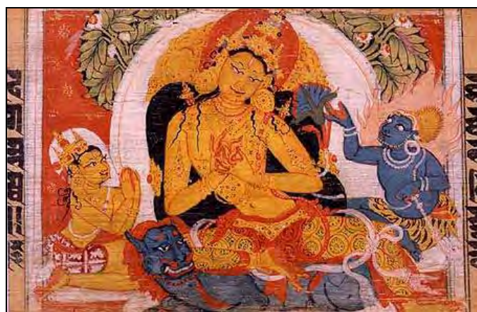
Painting of Manjusri Bodhisattva. Sanskrit Astasahasrika Prajnaparamita Sutra manuscript written in the Ranjana script. Nalanda, Bihar, India. Circa 700-1100 CE.