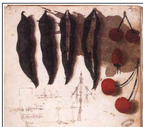
Leonardo da Vinci, studies, c. 1488.